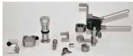
Adaptors for different applications