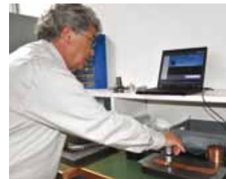
Equostat 3 probe connected to PC