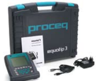
353 10 050 basic unit